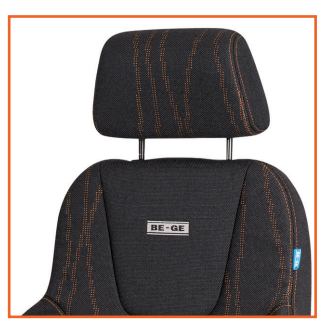
Separate head rest.