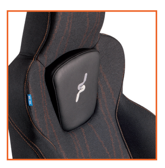
Shoulder support and Ergo back are options.

BE-GE 30-series are suitable for buses, trucks, railway and with its wide range of options it can be modified to be used in lots of applications, such as construction-, forestry- and industrial vehicles.